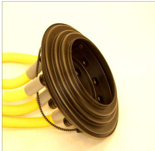
The newly designed DIRECT-IT fits on 12", 14", 16", & 18" duct rings