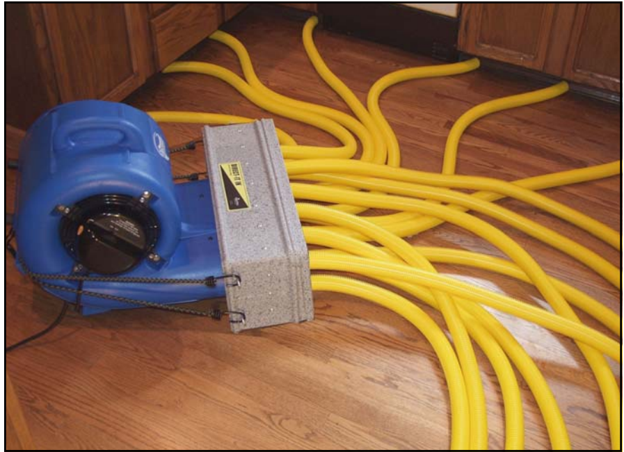
The DIRECT-IT IN drying cabinets (Dries in a positive mode)